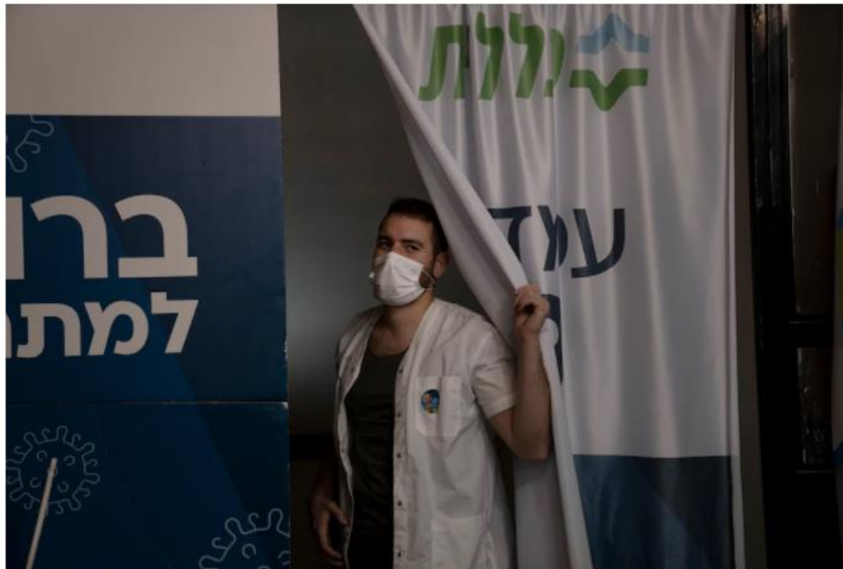
The decision to offer a fourth vaccine dose in the United States drew heavily from data in Israel, which approved in January a fourth dose for people most vulnerable to covid-19.